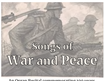
An Organ Recital commemorating 100 years after the Armistice of World War I

The concert event will include short scriptural and secular readings and a prayer for peace. This thrilling concert is presented free of charge. A free-will offering for Midwest Shelter for Homeless Veterans will be taken. All are invited to attend and to bring a friend.